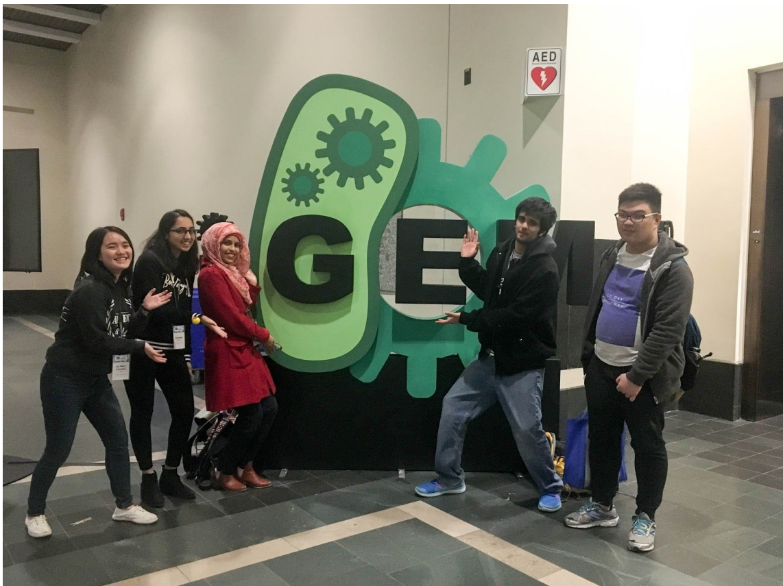
Team photo taken at Hynes Convention Centre, where the Giant Jamboree was held.

This year's iGEM Giant Jamboree was held in Boston, USA from 9th November to 13th November, 2017. Although it was in the midst of our crucial stage of the semester, attending the Giant Jamboree was an exceptional, once in a lifetime experience. It was the best place to see and gain practical knowledge about all the theories we see in textbooks in classes, as well as to explore our true interests. A massive gathering of students from all over the world, it was where we were able to reflect on our strengths and weaknesses as individuals, as a team and as undergraduate students at the University of Hong Kong (HKU). At the end we were able to successfully achieve a Bronze medal for our time and effort during the past year.