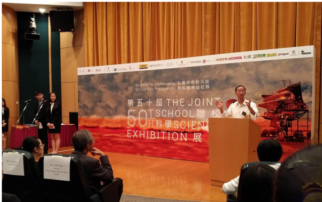
Closing ceremony of the Joint School Science Exhibition.

To showcase our project, we joined the Joint School Science Exhibition (JSSE) as a delegate university team. During the exhibition, we were able to talk to and present our project to a number of prestigious guests. Apart from that, we were also able to spread understanding and awareness of the fields of synthetic biology and DNA nanotechnology to the public.