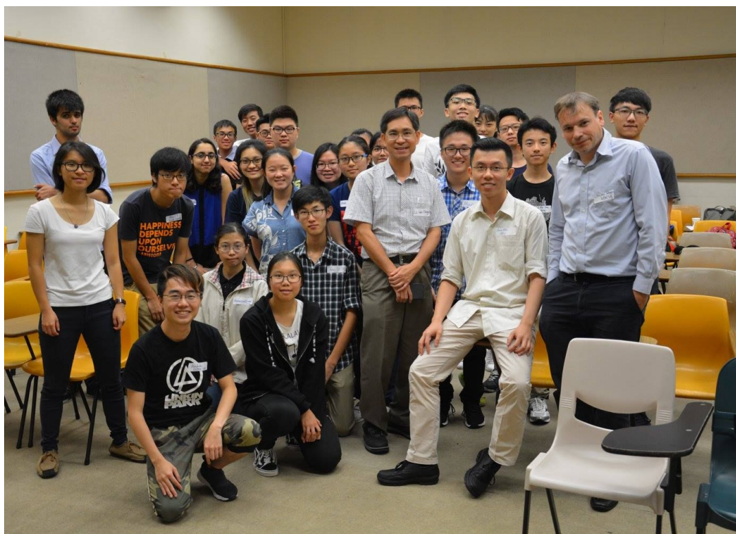
Group photo taken with the delegates of the Biosafety Sharing Session.